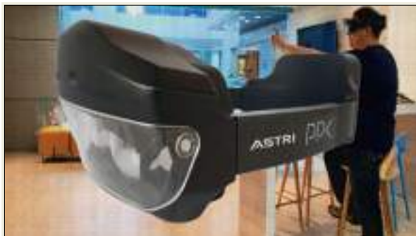
2019 香港工商業獎：設備及機械設計獎 - 香港應用科技研究院有限公司、香港盈盛股份有限公司的生物識別穿透式頭戴顯示器 2019 Hong Kong Awards for Industries: Equipment and Machinery Design Award - Biometrics Optical See Through Head Mounted Display by Hong Kong Applied Science and Technology Research Institute Company Limited, Profit Peak Hong Kong Holdings Limited