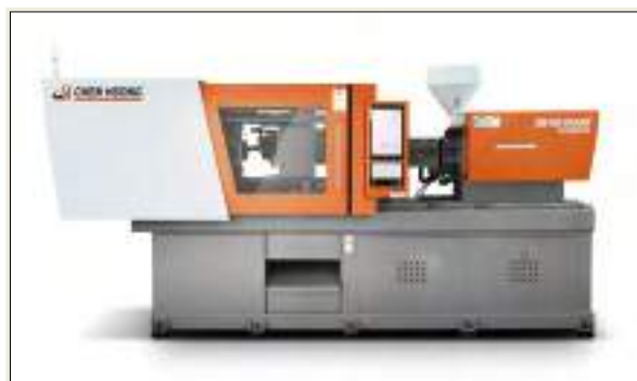
2019 香港工商業獎：設備及機械設計大獎 - 震雄集團有限公司的SPARK星火系列全電動注塑機 2019 Hong Kong Awards for Industries : Equipment and Machinery Design Grand Award - SPARK Series of All-Electric Injection Moulding Machine by Chen Hsong Holdings Limited

參賽公司必須在報名表格上填報參賽產品所屬的類別，但主辦機構有權將參賽產品按實際情況重新分類，或分配於該獎勵計劃下其他的產品設計比賽。