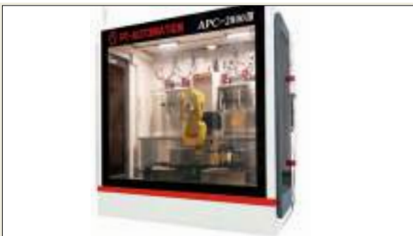
2019 香港工商業獎：設備及機械設計獎 - 實力機械有限公司的九軸自動拋光中心 (型號：APC-2800III)