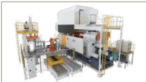
2019 香港工商業獎：設備及機械設計獎 - 力勁科技集團有限公司的DCC5000 大型鑄鑄生產單元 2019 Hong Kong Awards for Industries: Equipment and Machinery Design Award - DCC5000 Diecasting Cell by L.K. Technology Holdings Limited