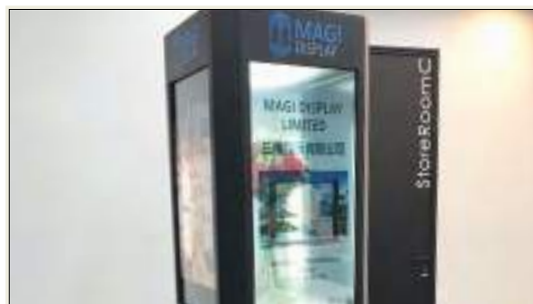
2019 香港工商業獎：設備及機械設計獎 - 三博顯示有限公司的Magic Touch AR 智能陳列櫃 2019 Hong Kong Awards for Industries: Equipment and Machinery Design Award - Magic Touch AR Smart Vitrine by Magi Display Limited