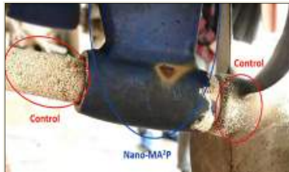
2019 香港工商業獎：設備及機械設計獎 - 遊艇主義有限公司的納米光催化海洋防污防腐漆 (Nano-MA 2 P) 2019 Hong Kong Awards for Industries: Equipment and Machinery Design Award - Nano-Photocatalytic Marine Antifouling/Anticorrosion Paint (Nano-MA 2 P) by Aviva Yacht Limited