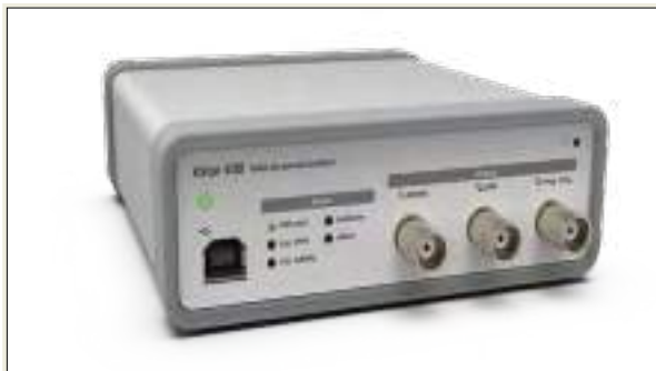
2019 香港工商業獎：設備及機械設計獎 - 香港晶體有限公司(科研集團)的GNSS 衛星同步時鐘 2019 Hong Kong Awards for Industries: Equipment and Machinery Design Award - GNSS Disciplined Oscillator by Hong Kong Xtals Limited (Member of Kolinker Group)